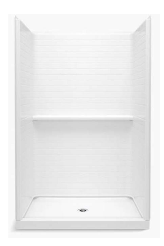
Sterling Traverse Vikrell Enclosure with tile surround look With Shower Rod