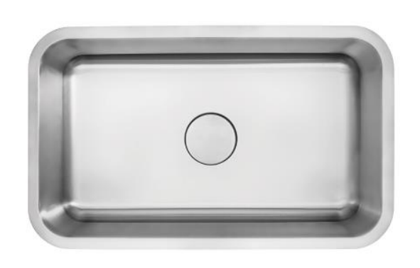
Stainless Steel Undermount Single Bowl