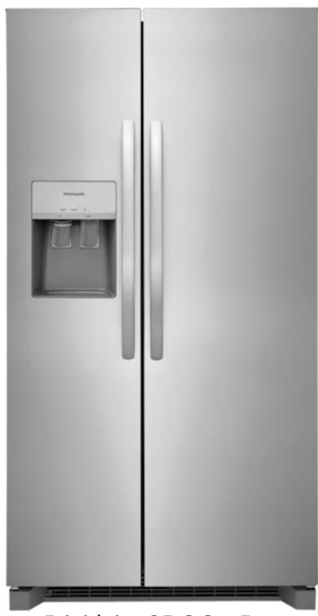
Frigidaire 25.6 Cu. Ft. 36" Standard Depth Side by Side Refrigerator Stainless Steel