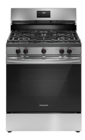
Frigidaire 30" Range Stainless Steel