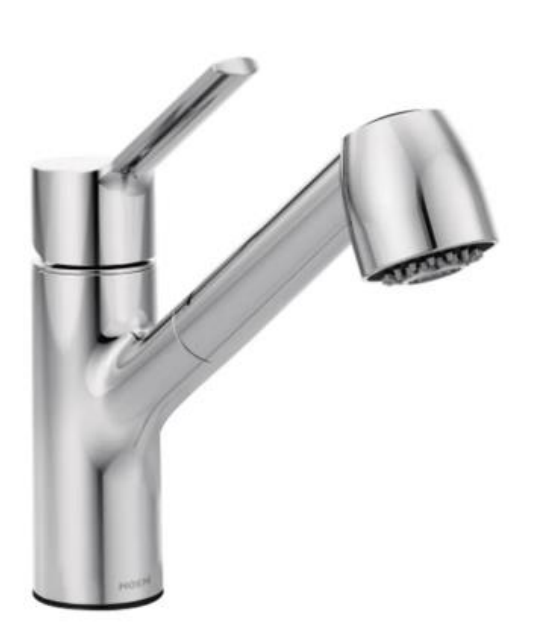
Moen Method Chrome