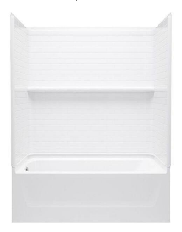
Sterling Traverse Vikrell Enclosure with tile surround look With Shower Rod