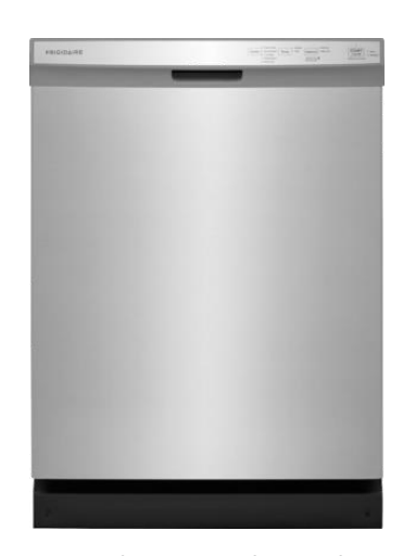
Frigidaire Dishwasher 24" Built-In – Stainless Steel