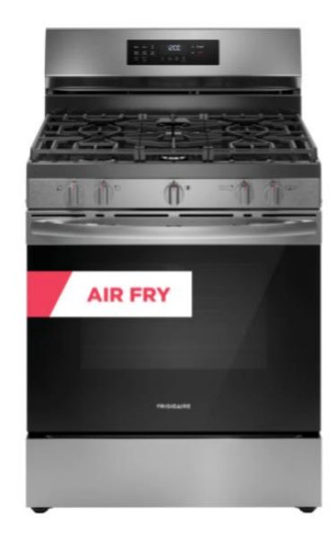
Frigidaire 30" Range With AirFry Stainless Steel