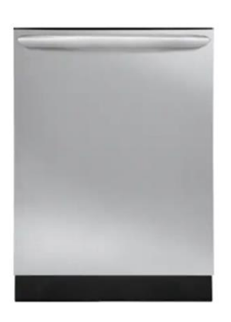
Frigidaire Gallery Dishwasher 24" Built-In – Stainless Steel