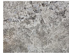
2CM SILVER FALLS GRANITE

ANDERSON FARMS 1A 1B HORIZON - STERLING QUARTZ PLUS