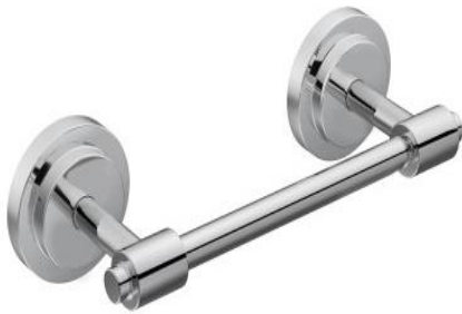
Moen ISO Chrome Pivoting Paper Holder DN0708CH