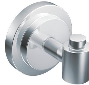
Moen ISO Chrome Single Robe Hook DN0703CH