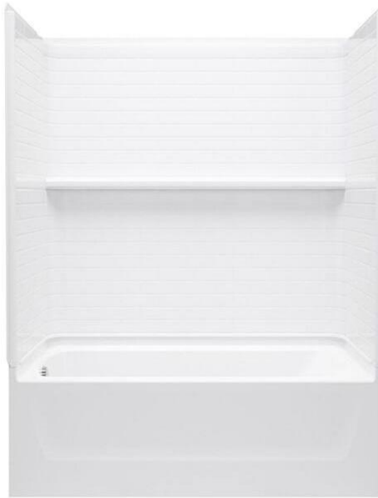
Sterling Traverse Vikrell Enclosure with tile surround look