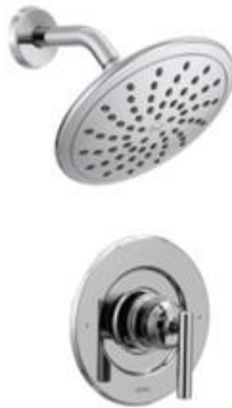
Owner's Bath And Next Gen (if applicable) Shower Valve Moen Gibson T3002EP Chrome Rain Shower Head 6345