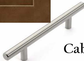
Cabinet Hardware - T-Bar Pull Polished Chrome