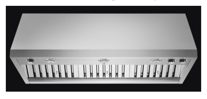
JennAir Pro-Style 48" Professional Wall-Mount Hood