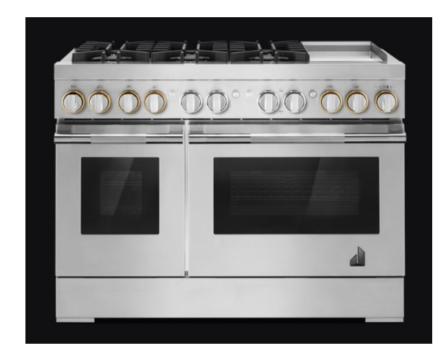
JennAir RISE™ 48" Dual-Fuel Professional Range With Chrome-Infused Griddle