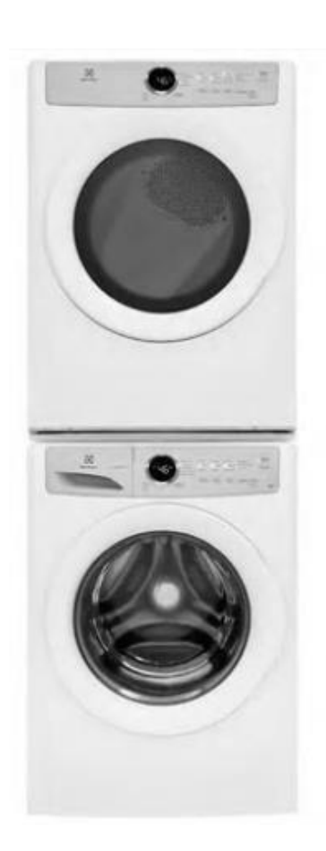
Stackable Washer/Dryer (in NextGen Suite only)