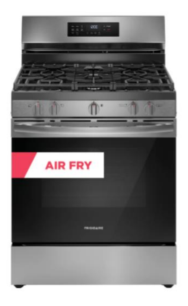
Frigidaire 30" Range With AirFry Stainless Steel