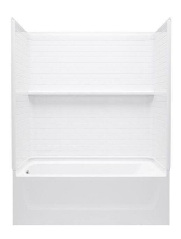
Sterling Traverse Vikrell Enclosure with tile surround look With Shower Rod