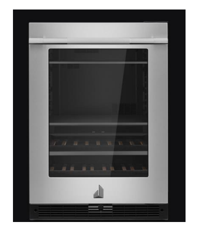
JennAir RISE™ 24" Built-In Undercounter Beverage Center Stainless Steel