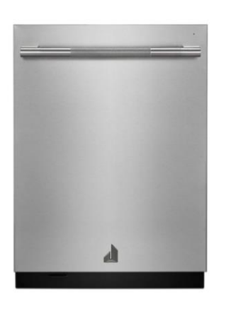
JennAir RISE™ 24-Inch Built-In Dishwasher in Stainless Steel