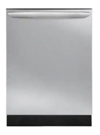
Frigidaire Gallery Dishwasher 24" Built-In – Stainless Steel