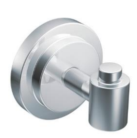
Moen ISO Chrome Single Robe Hook