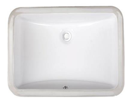
Bathroom Sinks with Upgrade Package