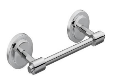
Moen ISO Chrome Pivoting Paper Holder