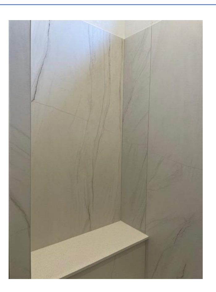
Porcelain Panels in Owner's Suite and NextGen Suite Note: Shower seat per plan, not included in all homes.