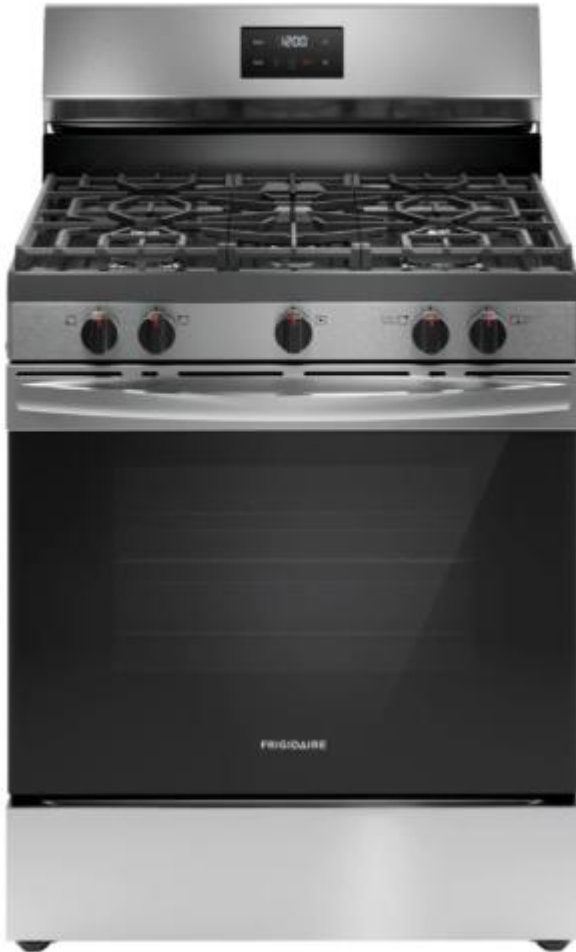
Frigidaire Range 30" Gas Range Stainless