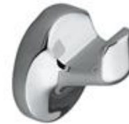
Moen Aspen Chrome Robe Hook