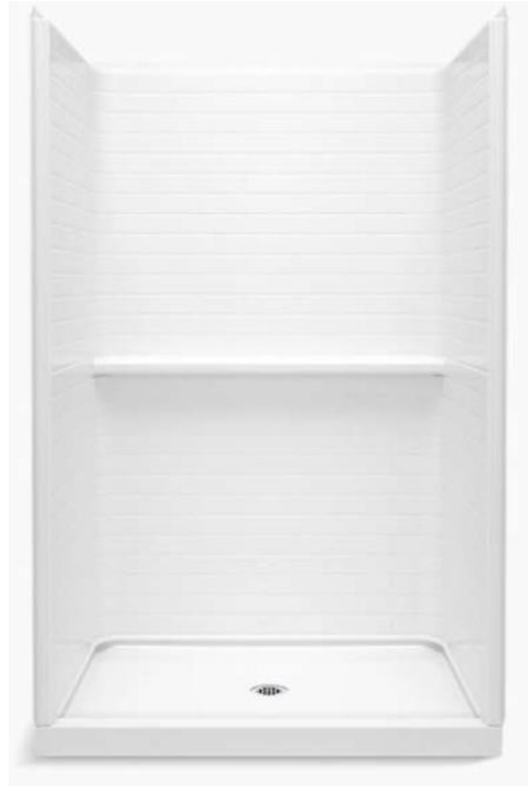
Sterling Traverse Vikrell Enclosure with tile surround look