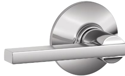
Solstice Finish: Chrome