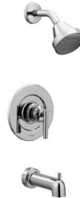
Tub/Shower Combo Faucet Moen Gibson Chrome T2903EP