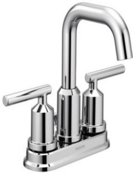
Bath Faucets Moen Gibson Chrome 6150 Two-Handle High Arc