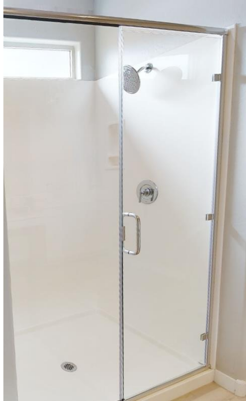
7' Cultured Marble Surrounds With Fiberglass Pan and swing door shower enclosure. (Note: some plans do not include a window)

Hawes Crossing Horizon Sterling Quartz Plus