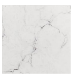
2CM BIANCO TIZA QUARTZ