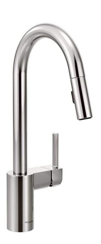
Moen Chrome One-Handle Align #7565