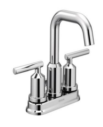
Bath Faucets Moen Gibson Chrome 6150 Two-Handle High Arc