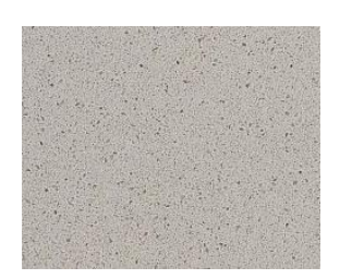
2CM ZINC QUARTZ