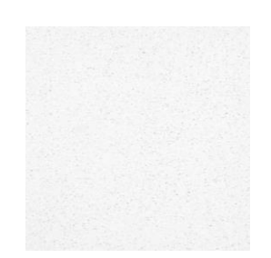
2 CM WHITE SAND-N QUARTZ