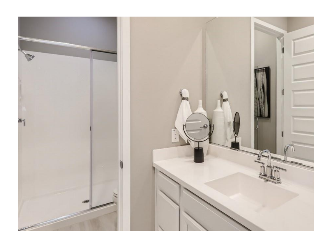
7' Cultured Marble Surrounds with Fiberglass Pan With Chrome bi-pass door – 80" Height

(Only applicable for Plan 5579-Bath 2 and Plan 5580-Bath 3)