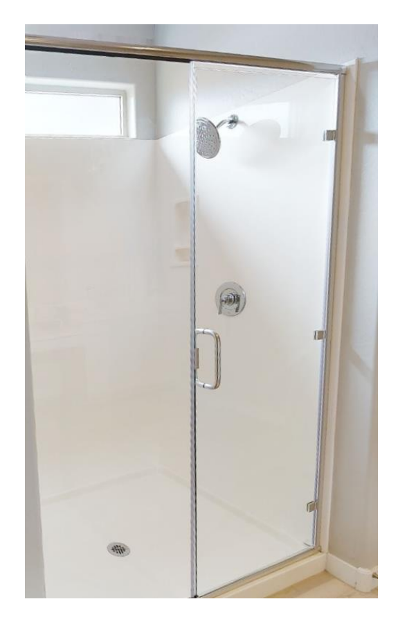
7' Cultured Marble Surrounds With Fiberglass Pan (note: some plans do not include a window)