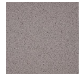
2CM CREST QUARTZ